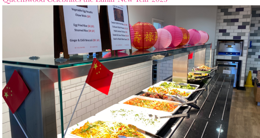
Queenswood celebrated the Lunar New Year on Friday and heralded the Year of the Rabbit with a sumptous Chinese banquet in our festively decorated servery.

Queenswood Celebrates the Lunar New Year 2023